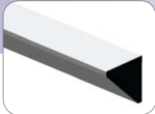
TQ1919 - PRIMED MDF TQ1818 - PRIMED FINGER JOINTED PINE