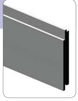
SHIPLAP 80 x 12mm to 140 x 12mm