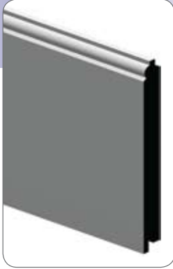
REGENCY: 140 x 12mm